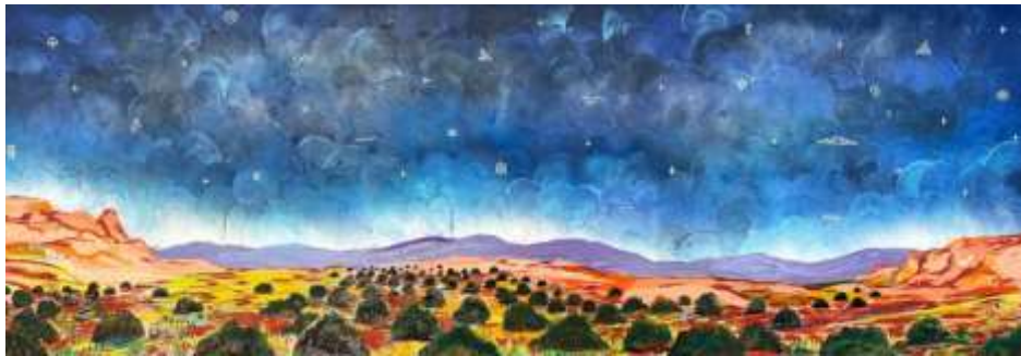
Jesse Littlebird, "Monsoon season up near Abiquiu," 2023, oil on canvas, 2.83' x 8'