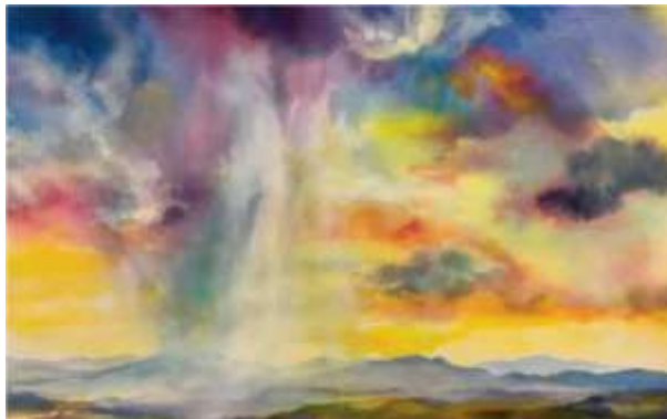
Angus Macpherson, "Colors Above Jemez," 2014, acrylic on canvas, 4.17' x 6.33'