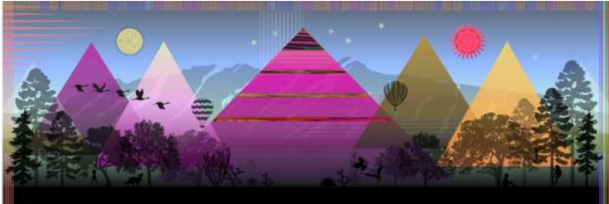
J P 제피, We are of the Mountain , mixed-media mural, 17' x 50'

The Committee reviewed 379 submissions for the TSA North Wall Commission. After multiple rounds of review, the Committee identified 6 finalists who submitted design proposals. J P 제피's proposal, entitled, We are of the Mountain , was selected for the TSA North Wall Commission site, pictured below. J P's We are of the Mountain will be recommended to City Council for Award. Installation will begin once approved by City Council.