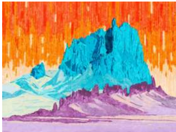
Virginia Primozi, "Sailing," 2021, paper on canvas, 2.5' x 3.33' x 1.5"