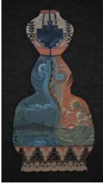
Deborah Jojola, "Equilibrium," 2023, fresco with earthen plaster and pigments, 2.96' x 1.5' x 1"