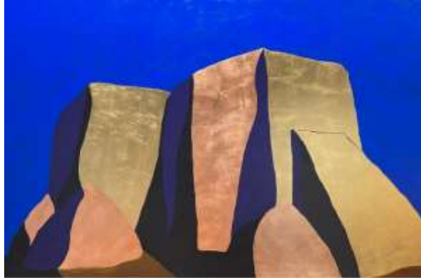
Alvin Gill-Tapia, "Saints View at the Asissi," 2023, gold and copper leaf and acrylic on linen, 4' x 6'

The Committee reviewed over 315 submissions expressing interest in the TSA North Wall (purchases and commission). The Committee selected 5 artworks for purchase from 5 New Mexico artists listed below.